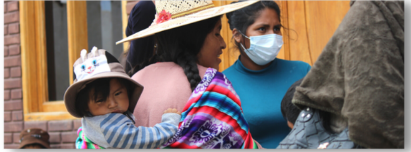
The theme for the 2022 World Mission Offering is "God is Doing Something New" based on Isaiah 43:18-21 which says: See, I am doing a new thing! Now it springs up; do you not perceive it? I am making a way in the wilderness and streams in the wasteland.