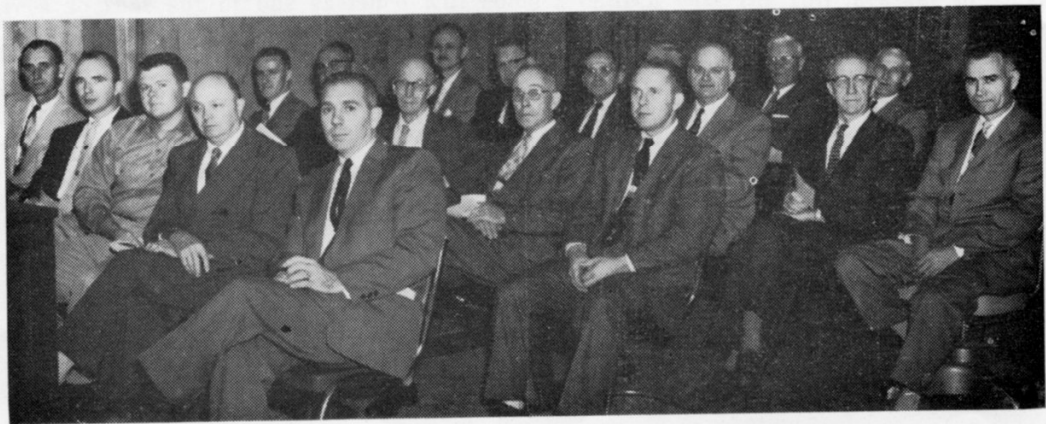
MENS CLASS IN CARPENTERS HALL