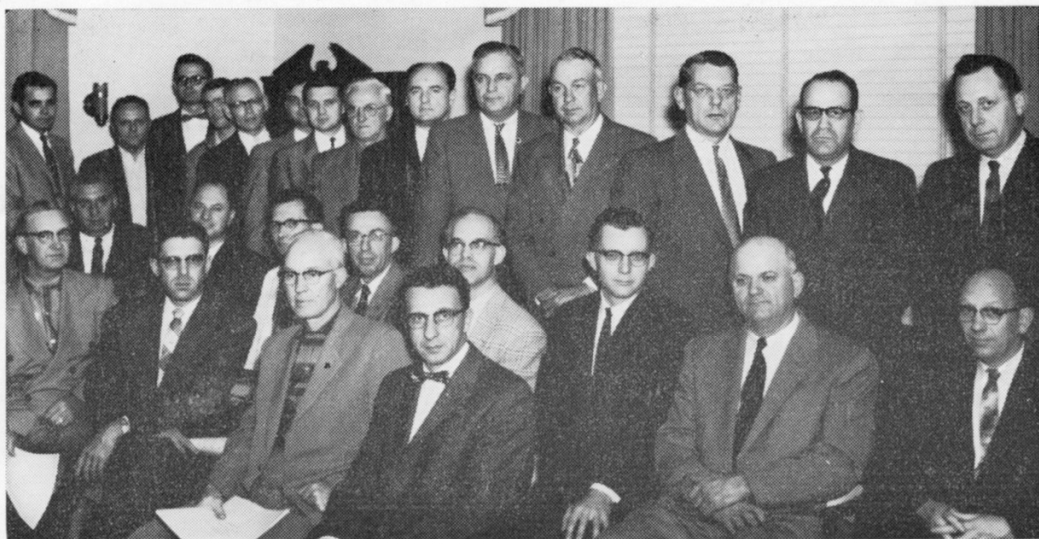
Some of Canvass Leaders